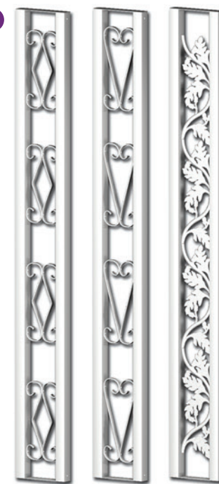
Flat Porch Columns Choice of Diamond, Heart and Oak leaf scroll design. 8 or 10 foot length can be cut to required size.