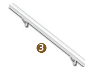
Hand Rails Choice of 8', 12', or 16' length (end knobs furnished)