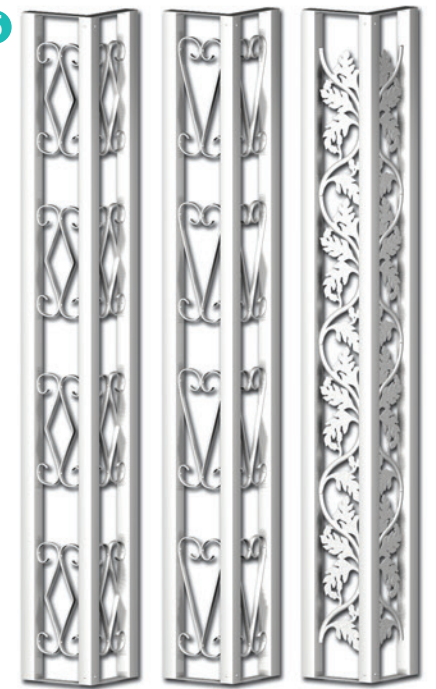
Corner Porch Columns Choice of Diamond, Heart and Oak leaf scroll design. 8 or 10 foot length can be cut to required size.