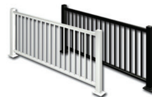
1/2 inch pickets in white or black

Age Craft residential railings are constructed with a heavy-gauge, super-strong aluminum for the safest and longest installation life. The all rivet design gives the railing durability and makes it easy to adjust sections to your step angles.